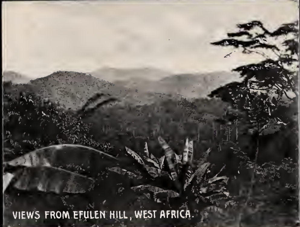
VIEWS FROM EFULEN HILL, WEST AFRICA.