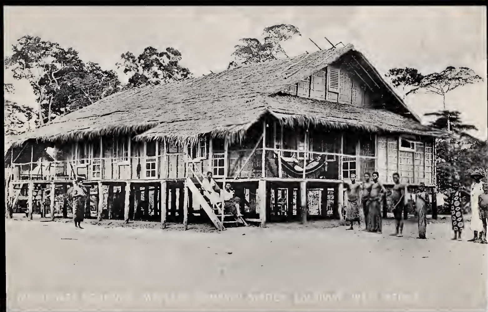
THE HOUSE OF THE CHIEF OF THE VILLAGE OF KAUAI, HAWAII