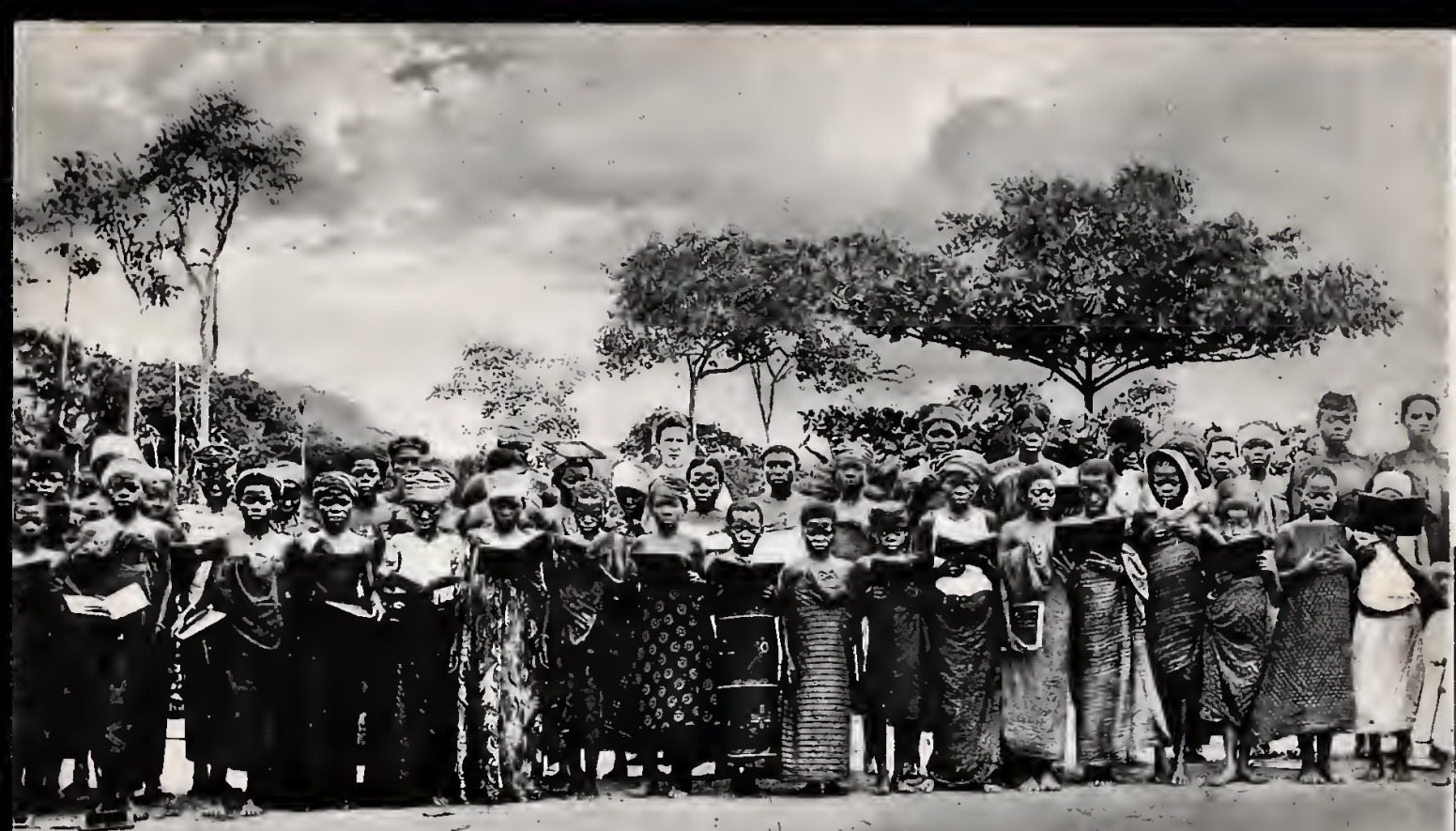
GIRLS' SCHOOL MALLEK MEMORIAL STATION, KAMERUN, WEST AFRICA. 13791.