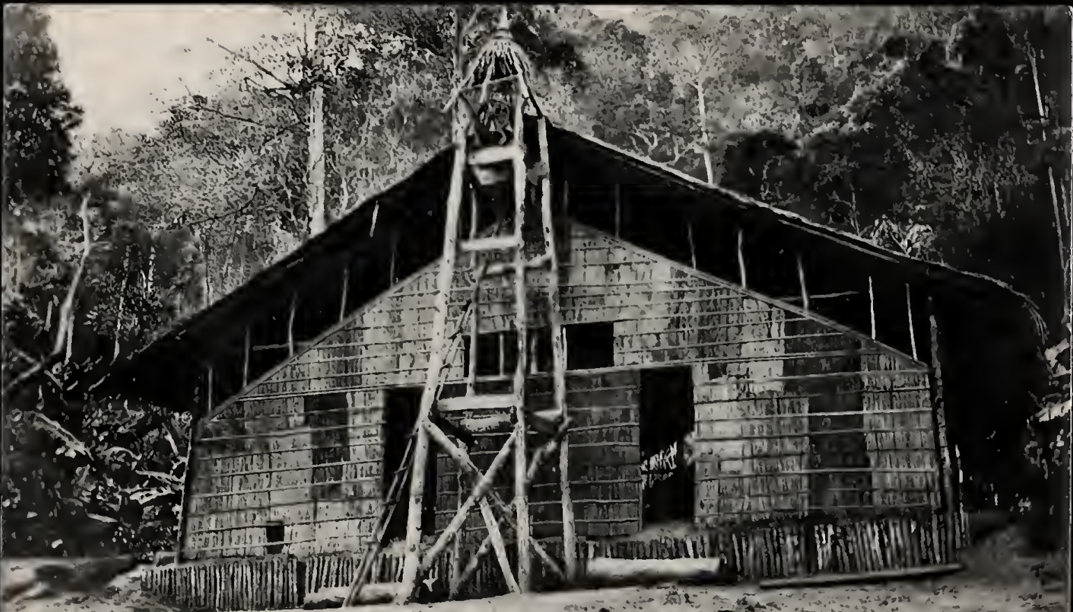
Presbyterian Church at Lam, Kamerun, West Africa.