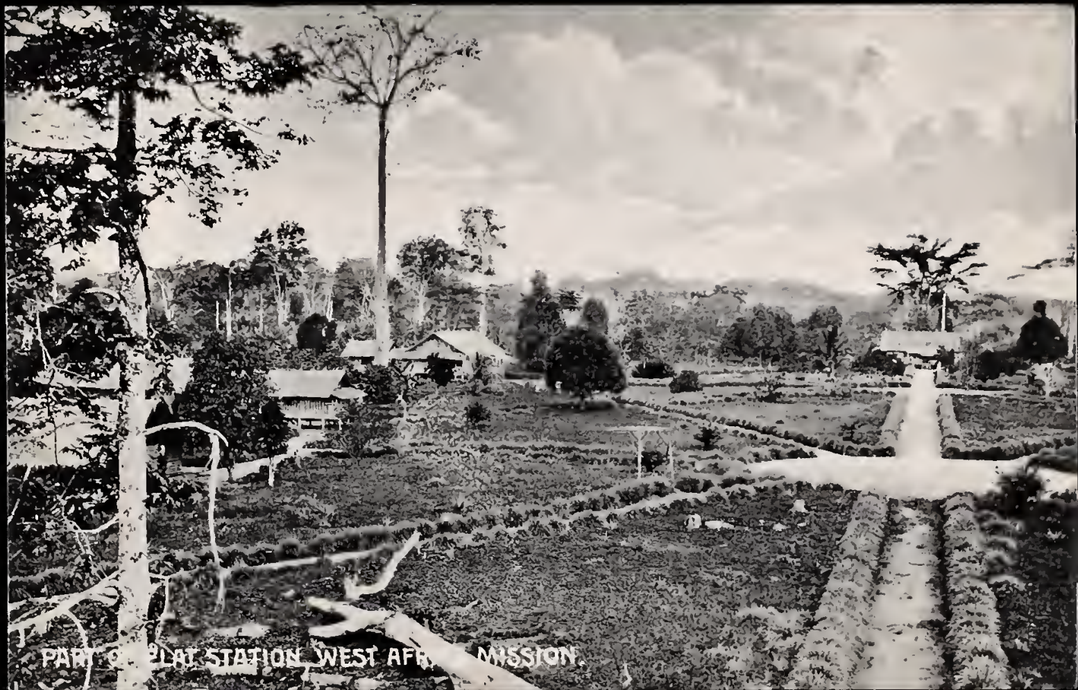
PART OF PLANTATION STATION WEST AFRICAN MISSION.