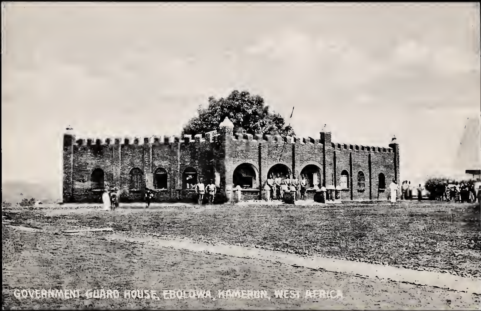
GOVERNMENT GUARD HOUSE, EBOLOWA, KAMERUN, WEST AFRICA