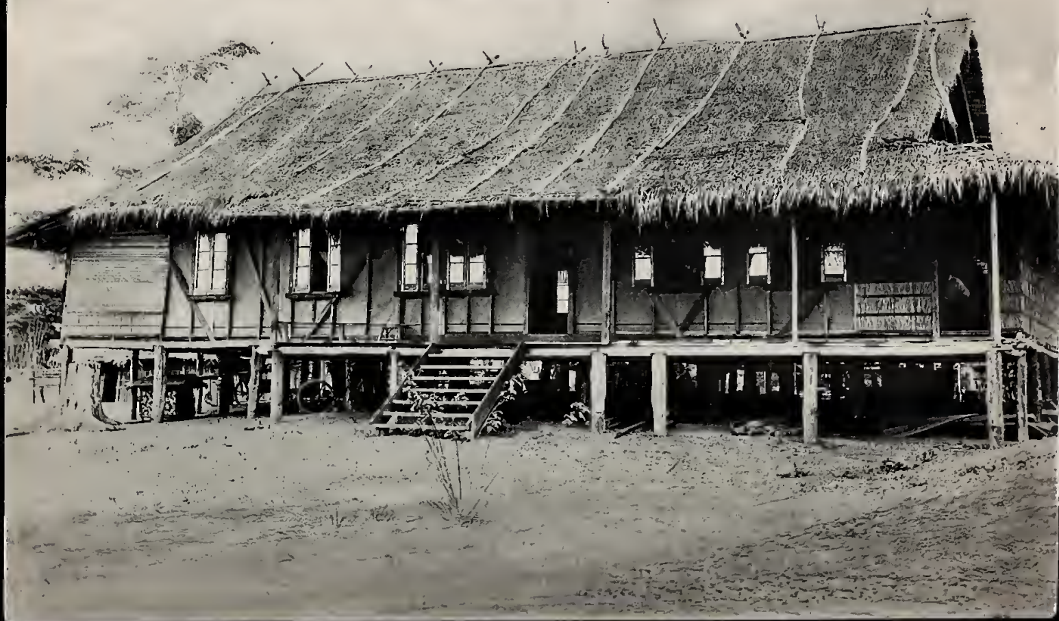
Missionary Residence - Metet, Kamerun, West Africa.