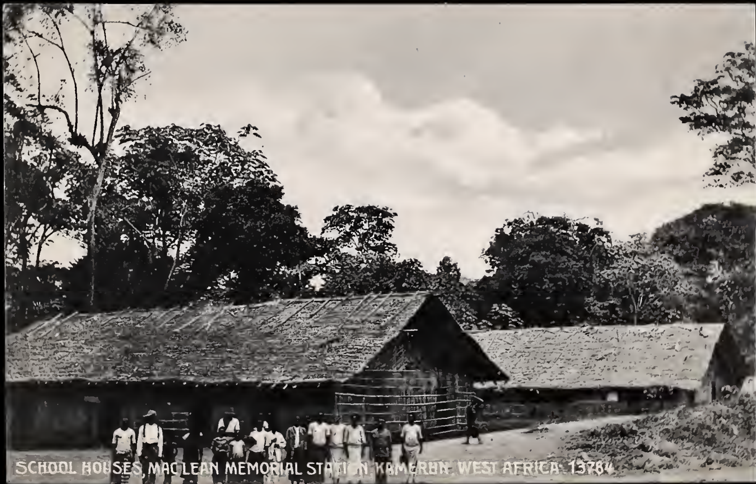
SCHOOL HOUSES, MACLEAN MEMORIAL STATION, KAMERUN, WEST AFRICA, 1904