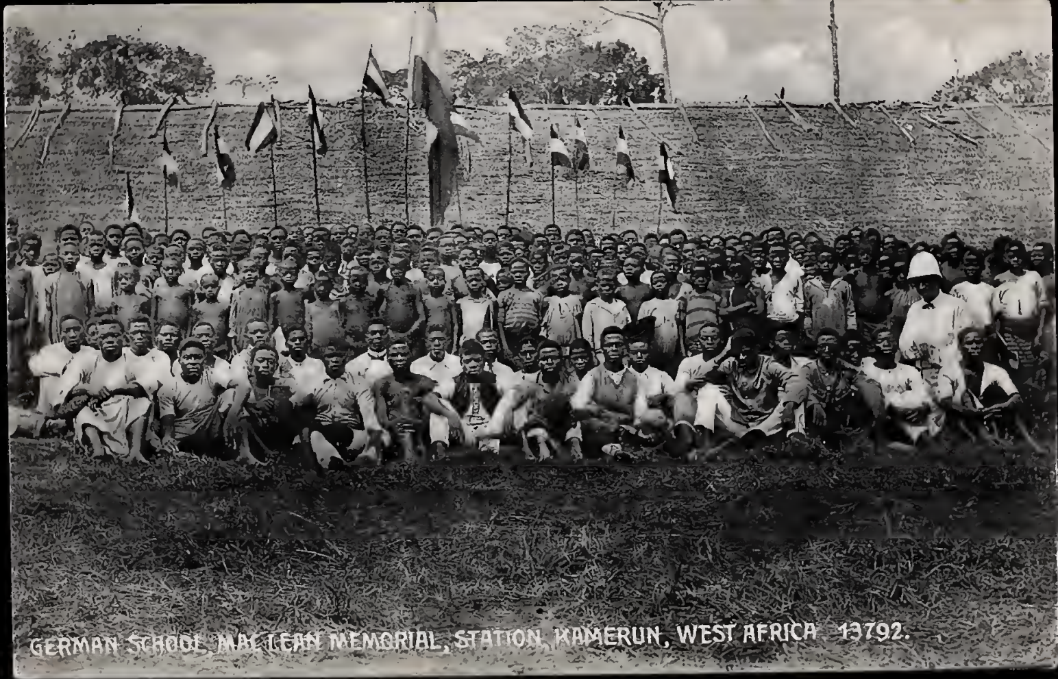
GERMAN SCHOOL, MAC LEAN MEMORIAL, STATION, KAMERUN, WEST AFRICA 13792.