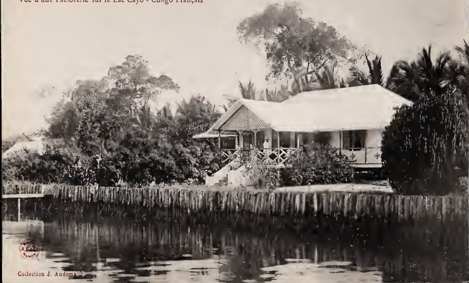
Vue d'une Factorerie sur le Lac Cayo - Congo Français