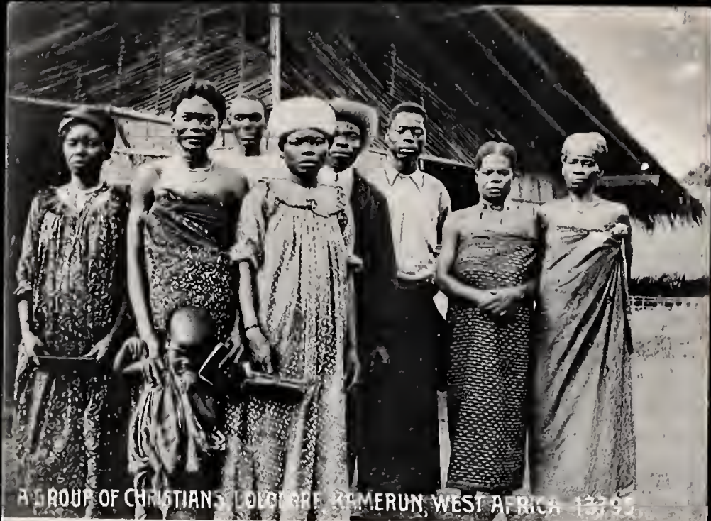
A GROUP OF CHRISTIANS, LOGBARRÉ, CAMERUN, WEST AFRICA 13795