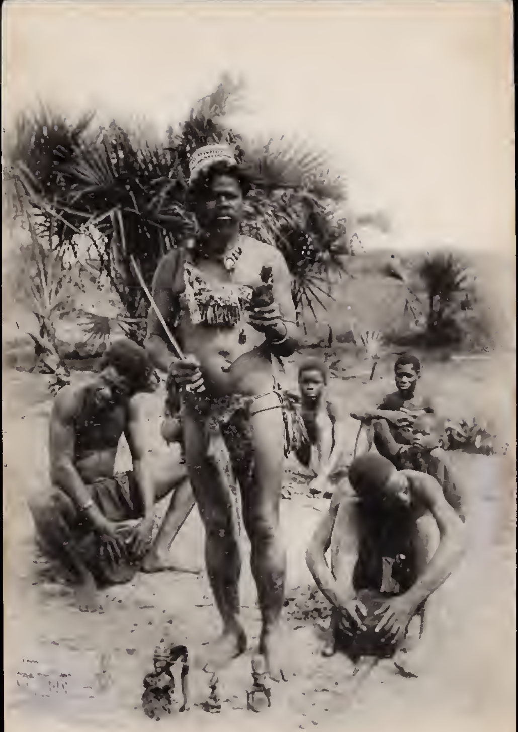
Scène de fétichisme - Bavili - Congo Français