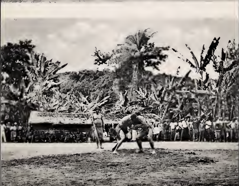
A WRESTLING MATCH, THE BULU NATIONAL SPORT