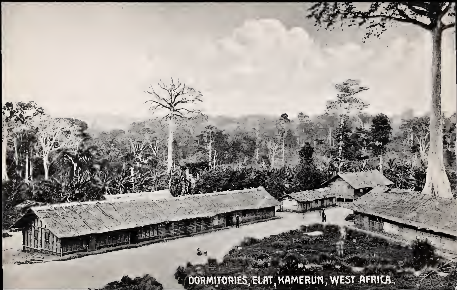
DORMITORIES, ELAT, KAMERUN, WEST AFRICA.