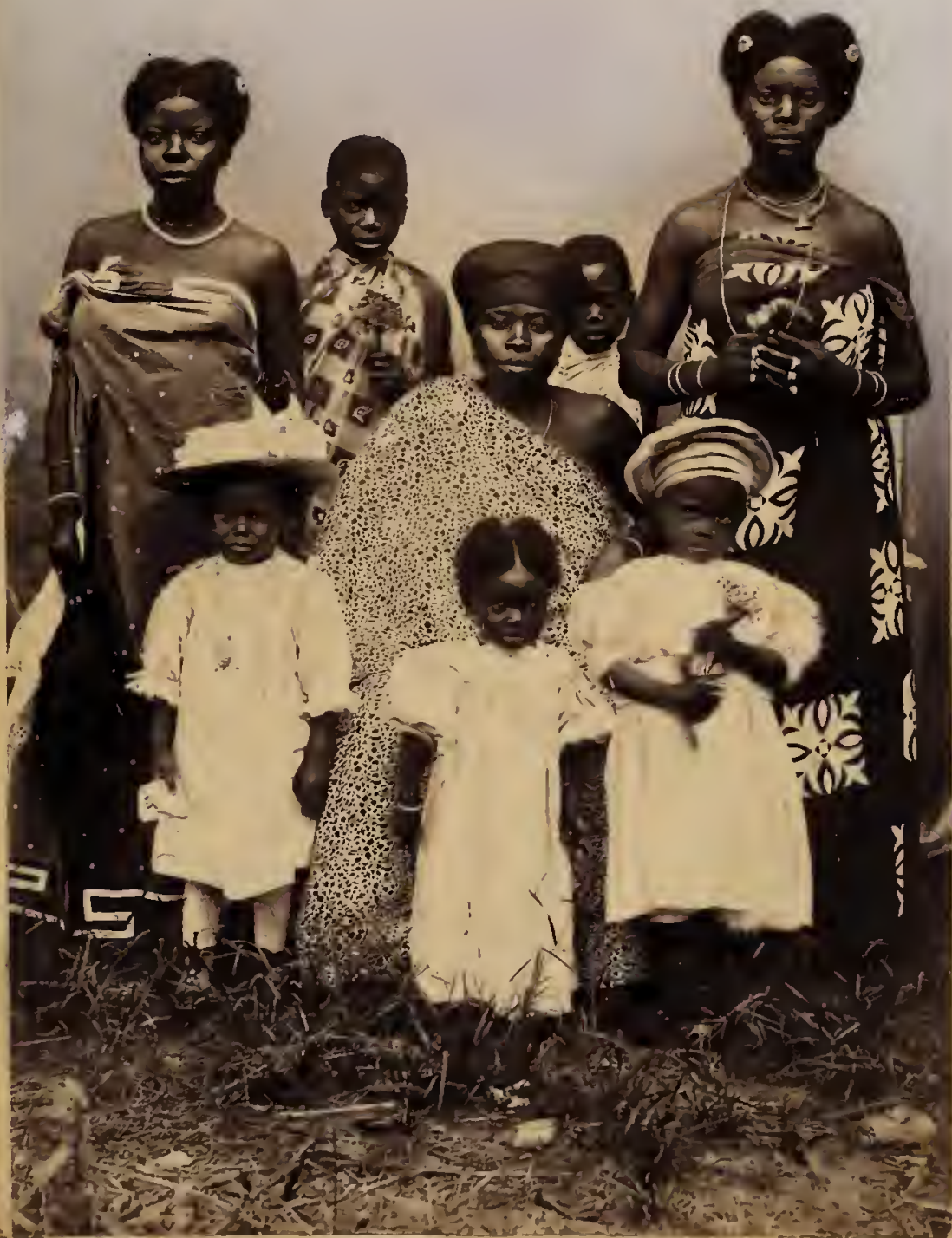
Mpongwé Family Libreville ; Gaboon. W. A. G.