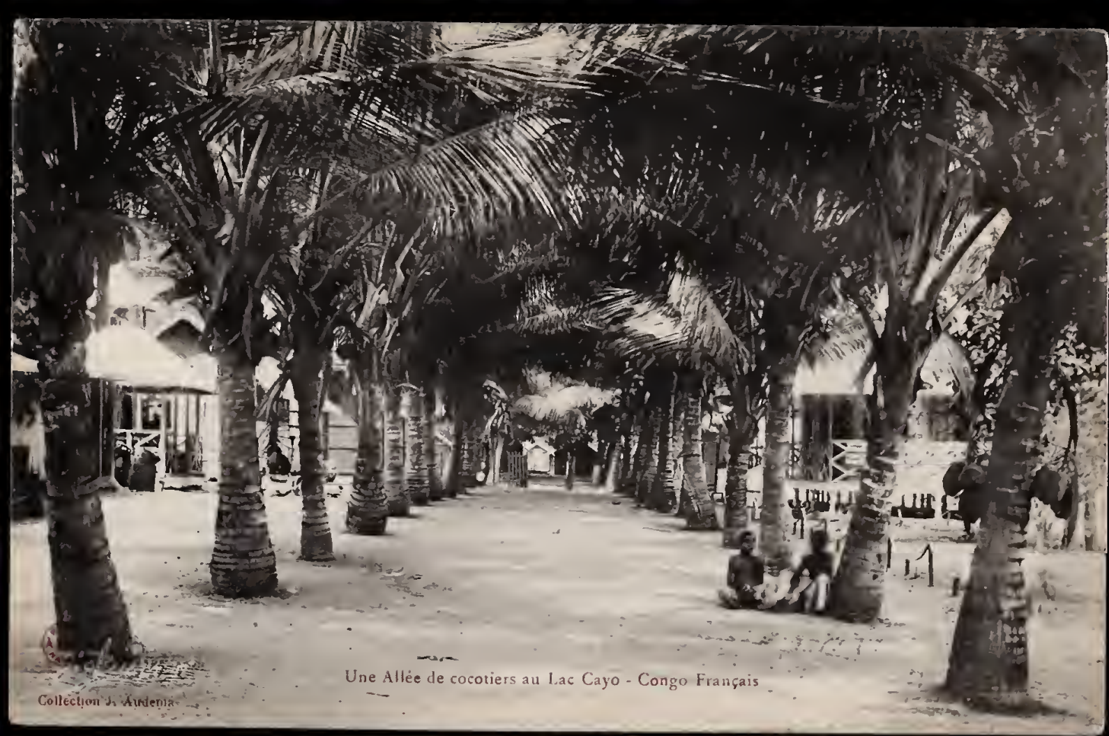
Une Allée de cocotiers au Lac Cayo - Congo Français