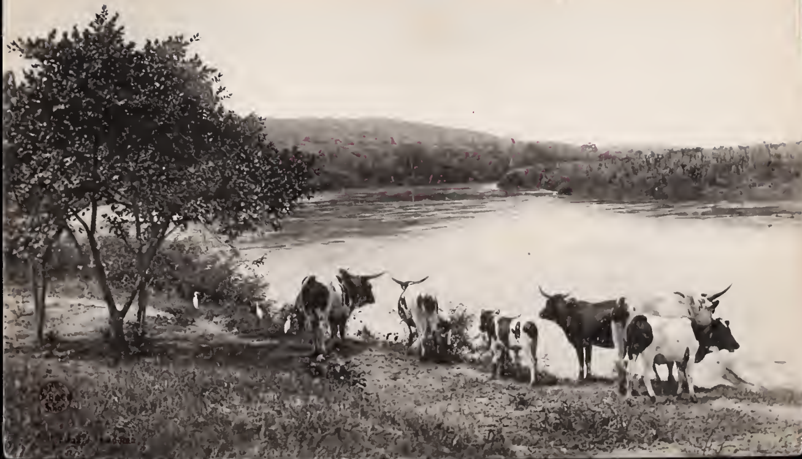
Sur les bords du Niari à Loudima - Congo Français