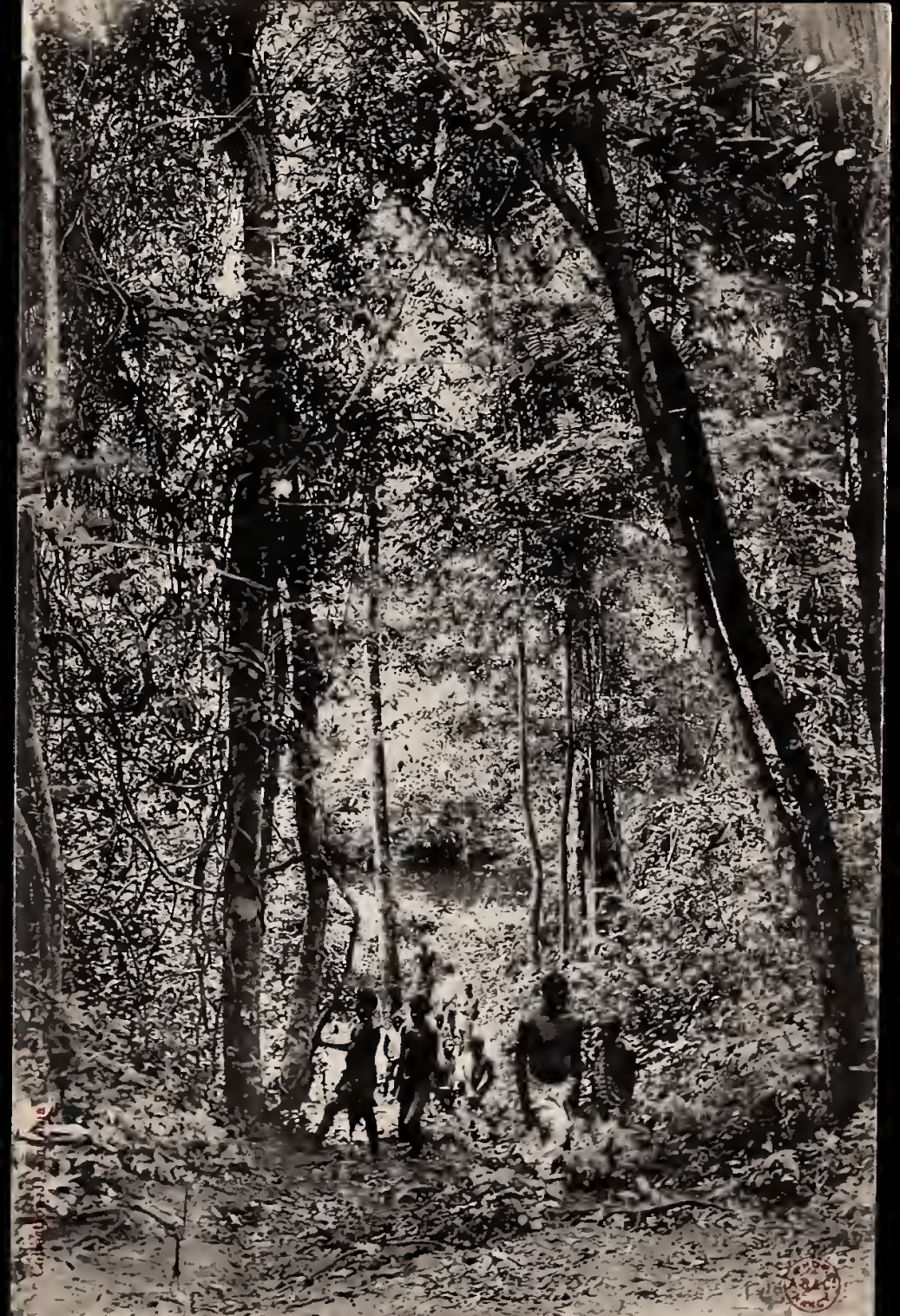
Dans le Mayumoe - Congo Français -