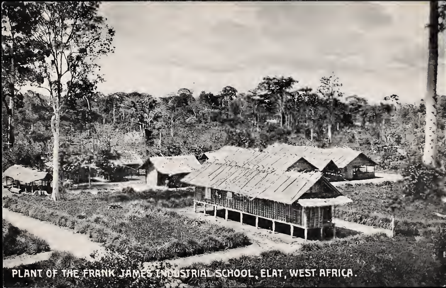
PLANT OF THE FRANK JAMES INDUSTRIAL SCHOOL, ELAT, WEST AFRICA.