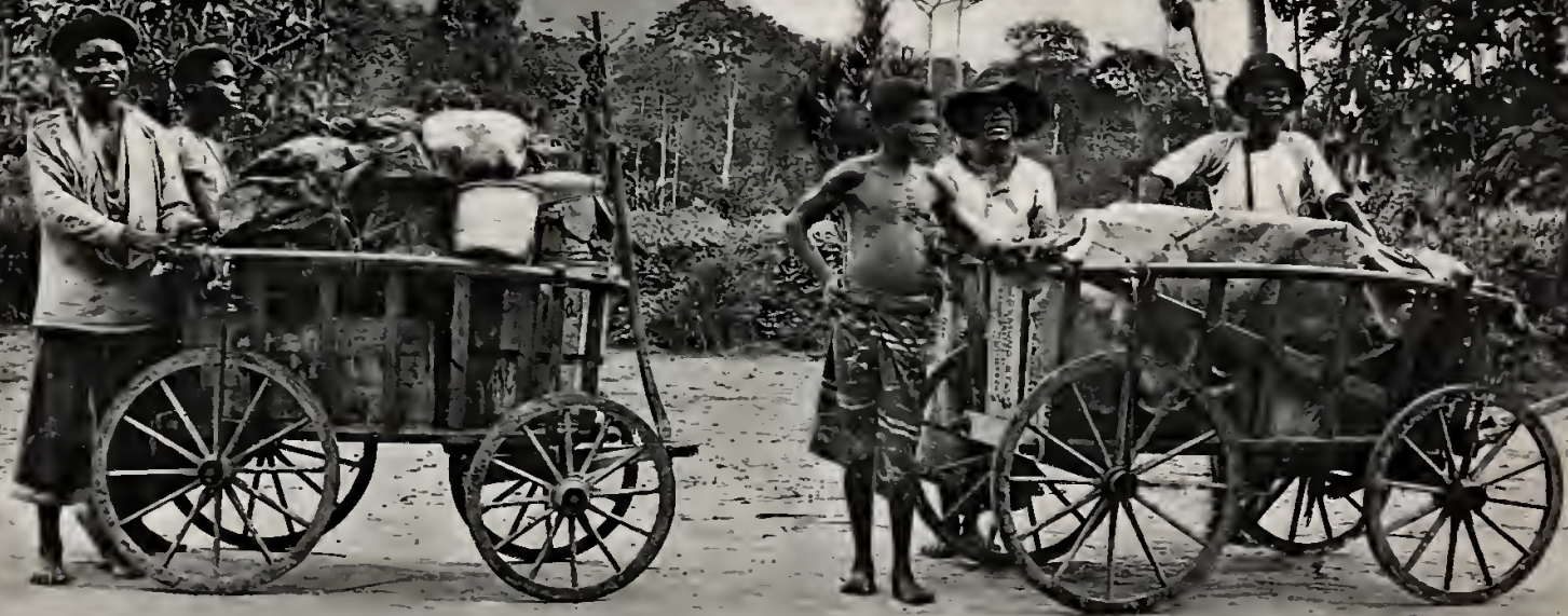
Wagon Transportation to the Interior of Kamerun, West Africa.