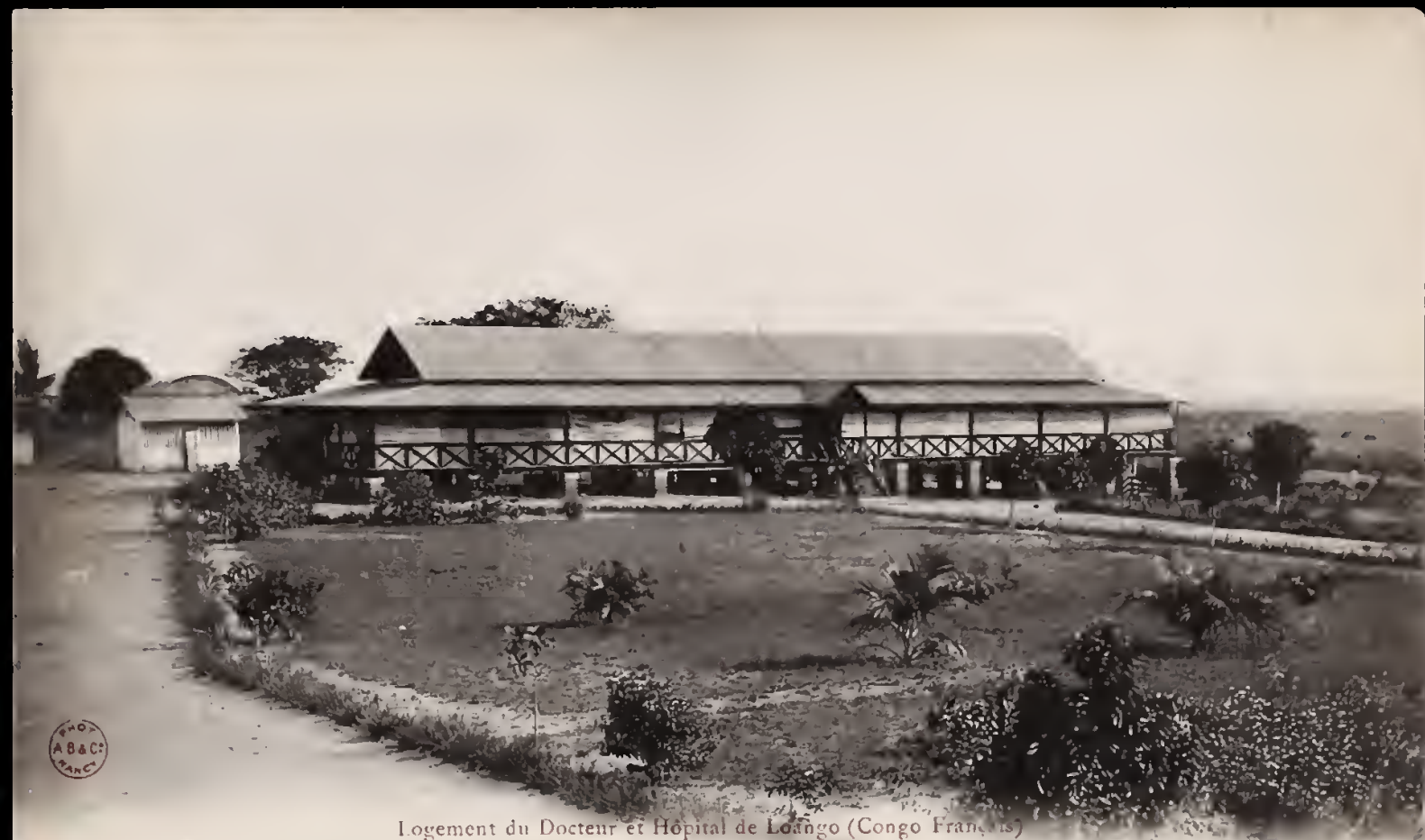
Logement du Docteur et Hôpital de Loango (Congo Français)