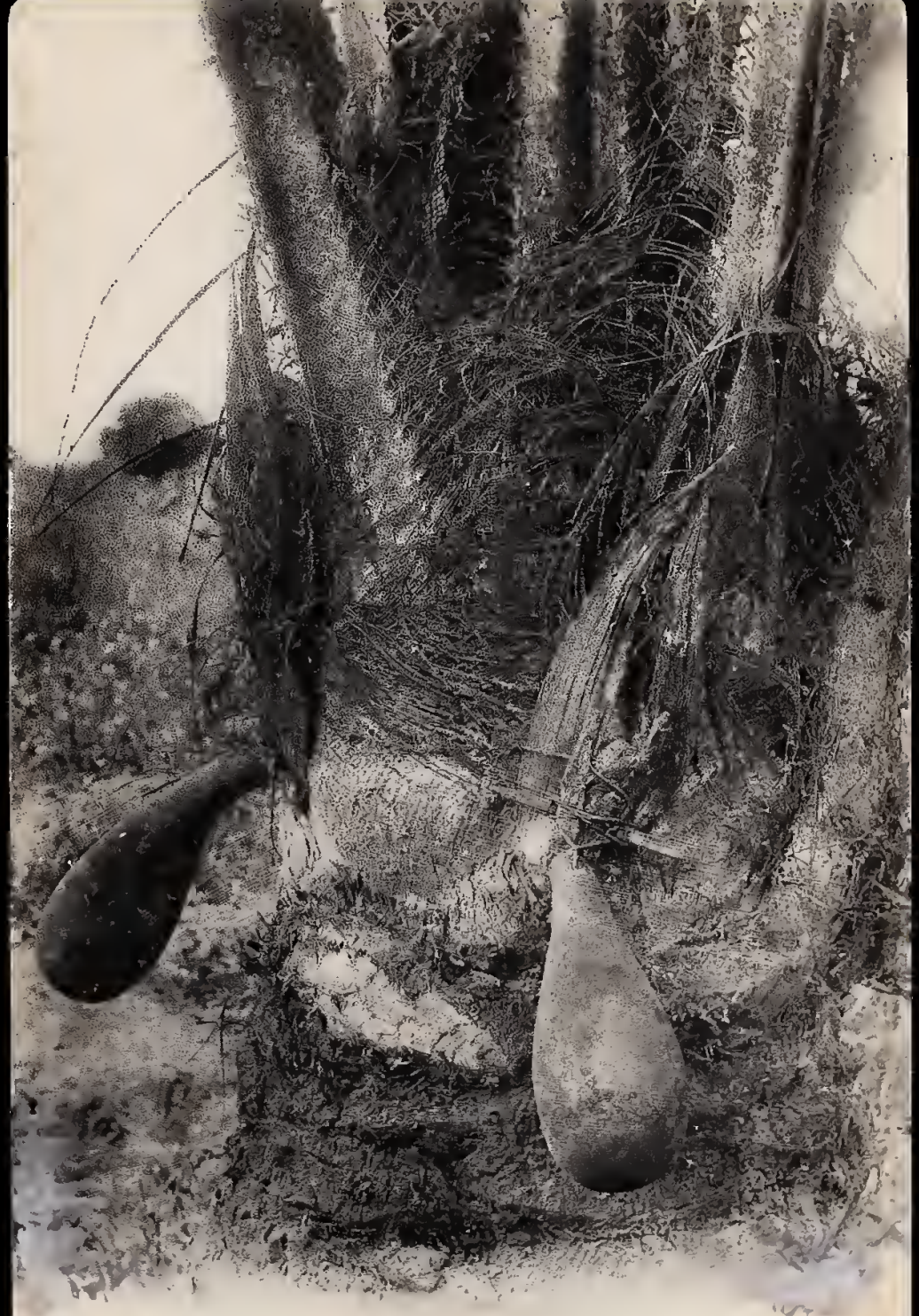
Procédé loango pour recueillir le vin de Palme - Congo Français