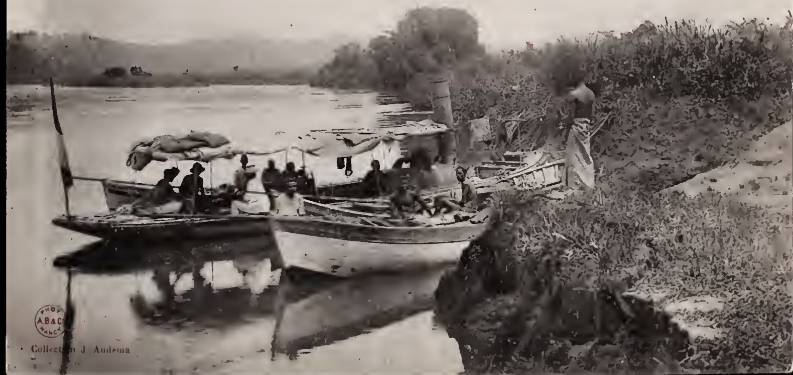
Le Vapeur " Capitaine Pleigneur " à Loudima-Mâri - Congo Français