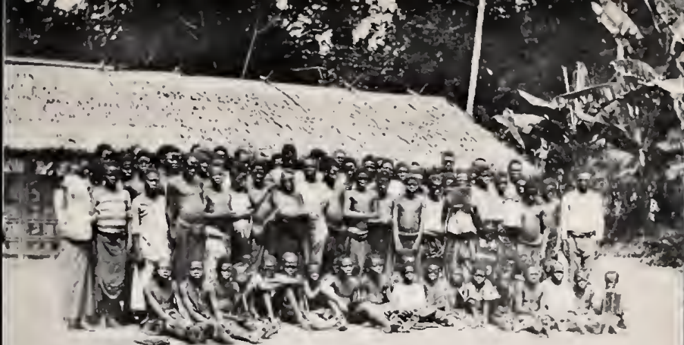
A VILLAGE SCHOOL IN WYOMING, WEST AFRICA