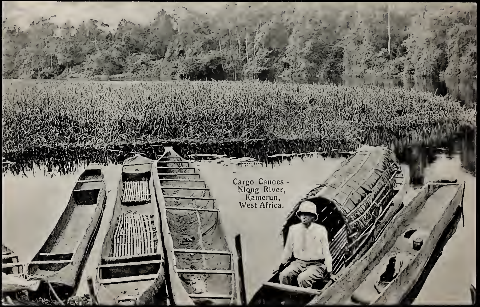
Cargo Canoes - Nlong River, Kamerun, West Africa.