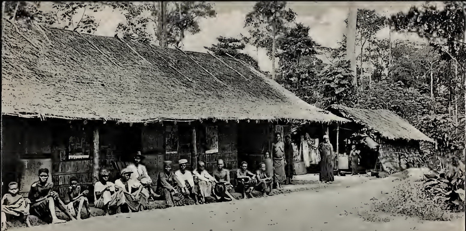
Men's Hospital - Mac Lean Memorial Station, Kamerun, West Africa.