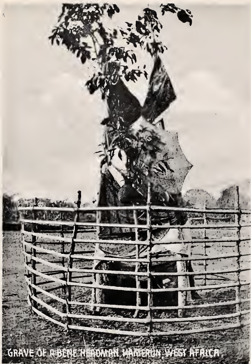
GRAVE OF ABENE HEADMAN WADERON WEST AFRICA