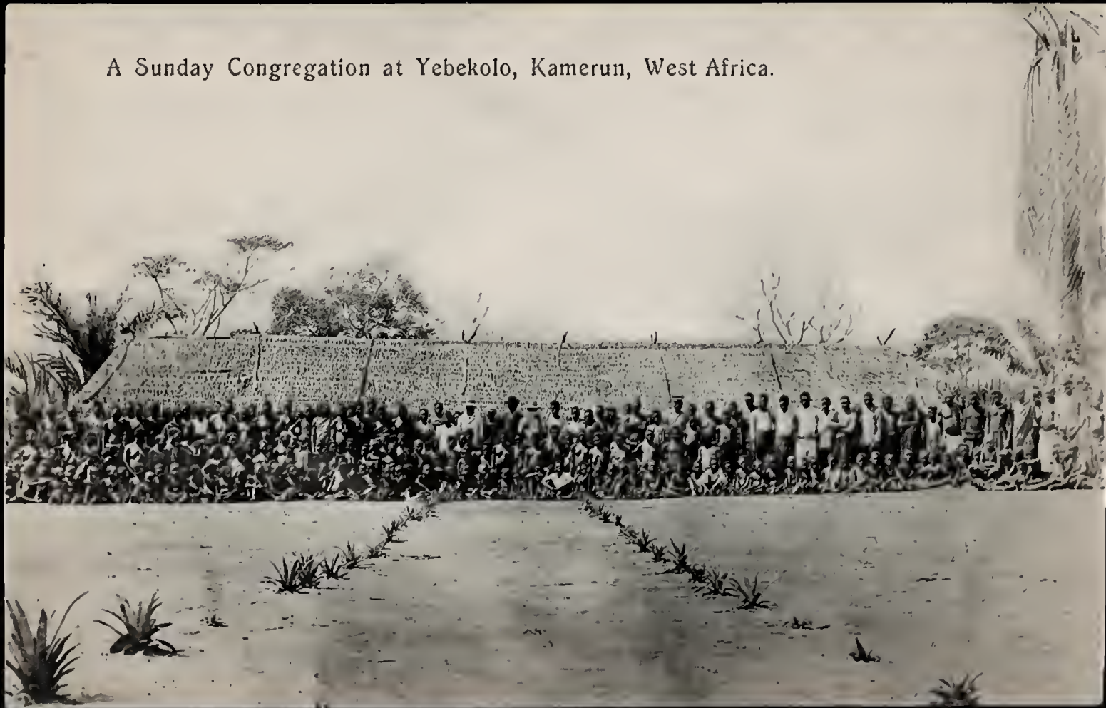
A Sunday Congregation at Yebekolo, Kamerun, West Africa.