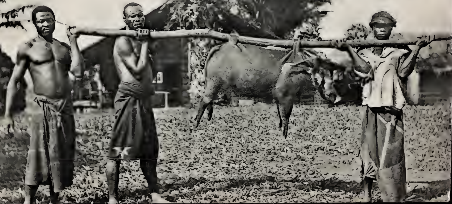
A Wild Hog - Kamerun, West Africa.