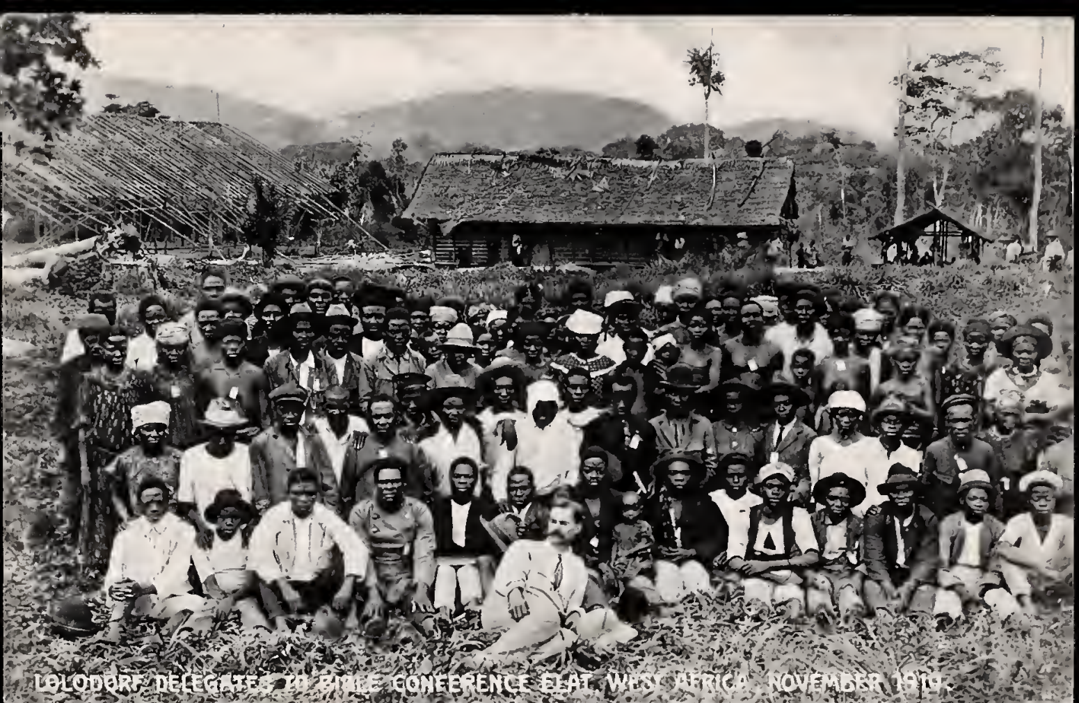
LOLODORF DELEGATES TO BIBLE CONFERENCE ELAT, WEST AFRICA, NOVEMBER 1910.