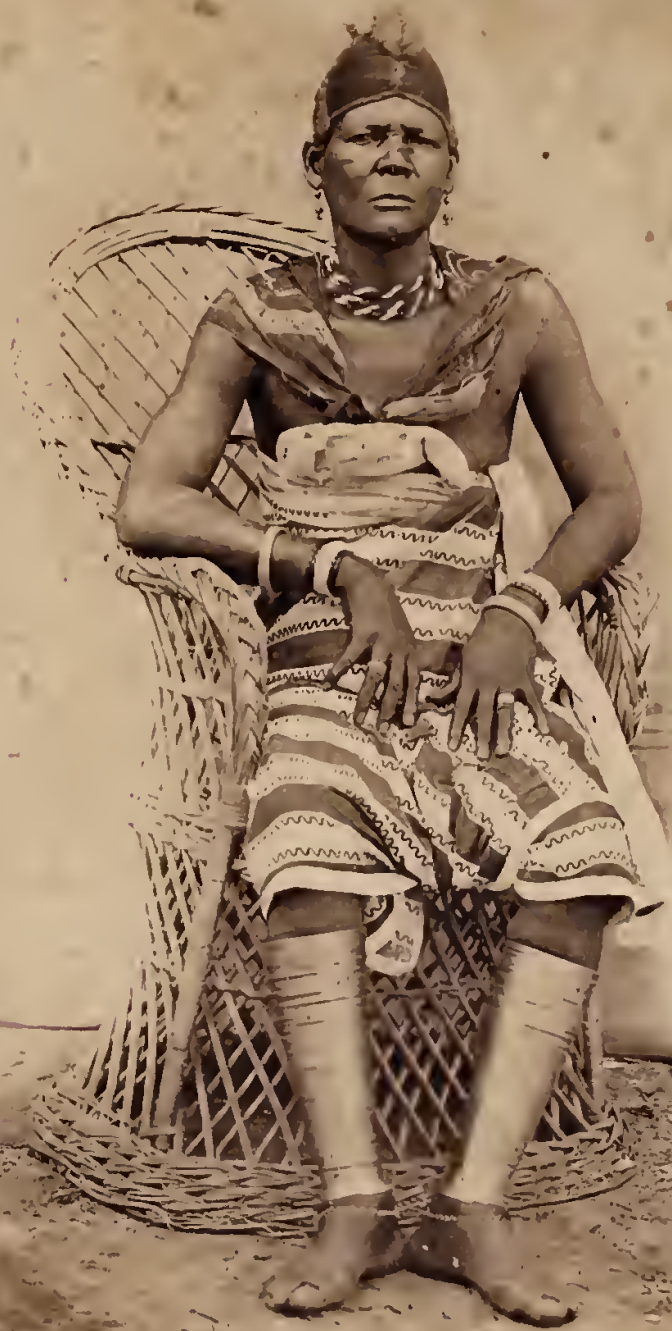
Native Woman. 2201.