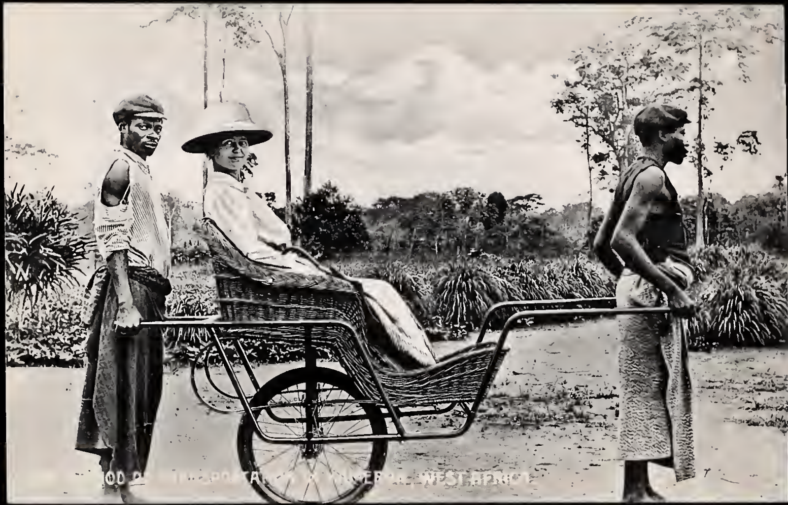
100 P. THE PORTAL OF THE WEST INDIES