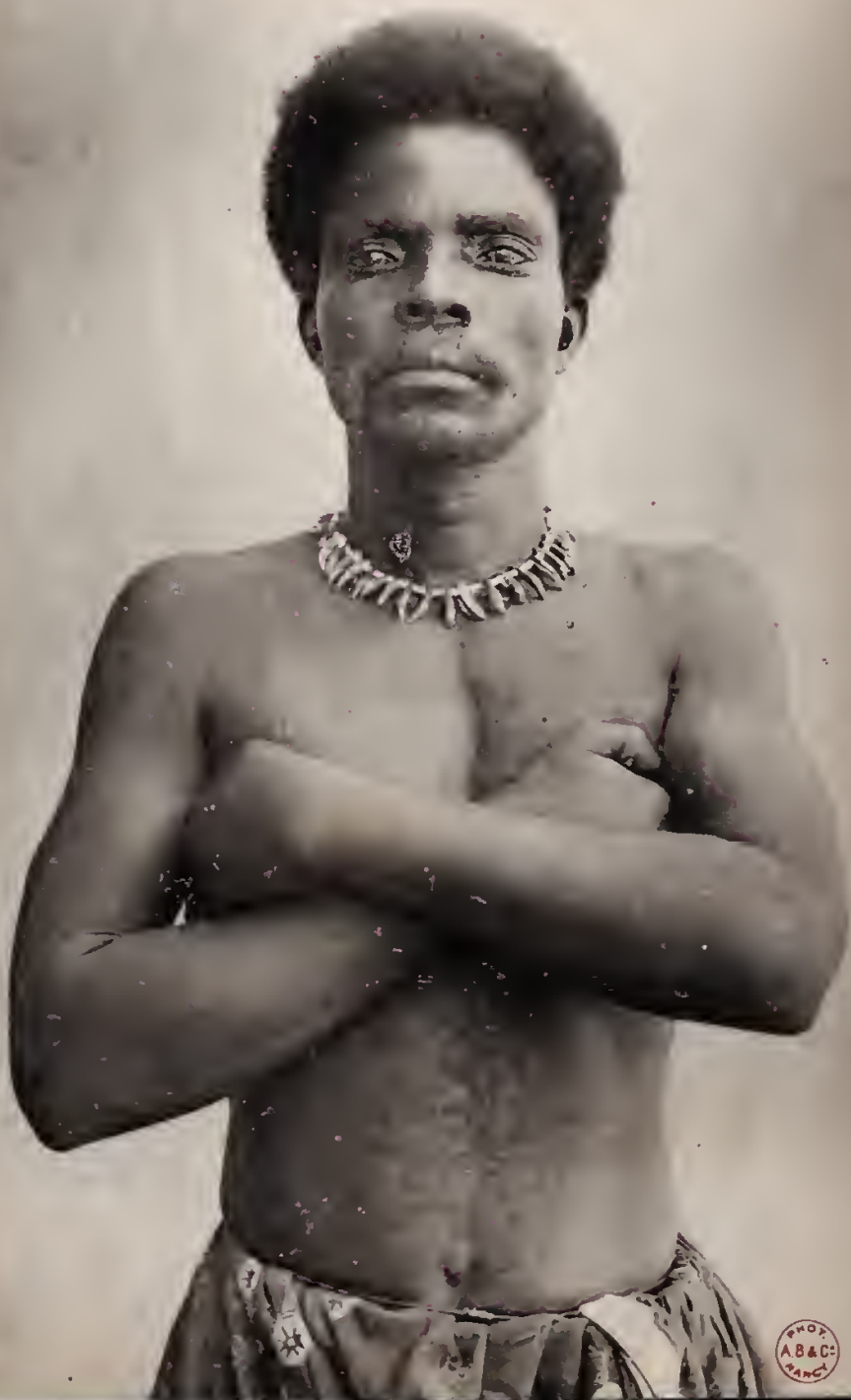
Type Bakouni - Congo Français