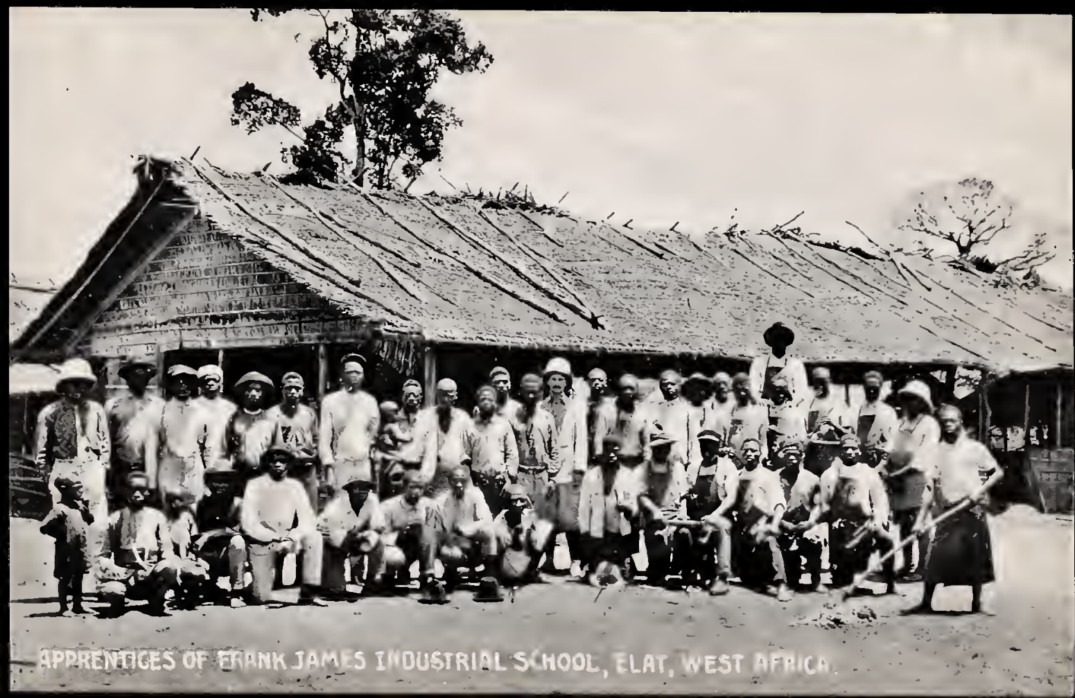
APPRENTICES OF FRANK JAMES INDUSTRIAL SCHOOL, ELAT, WEST AFRICA.