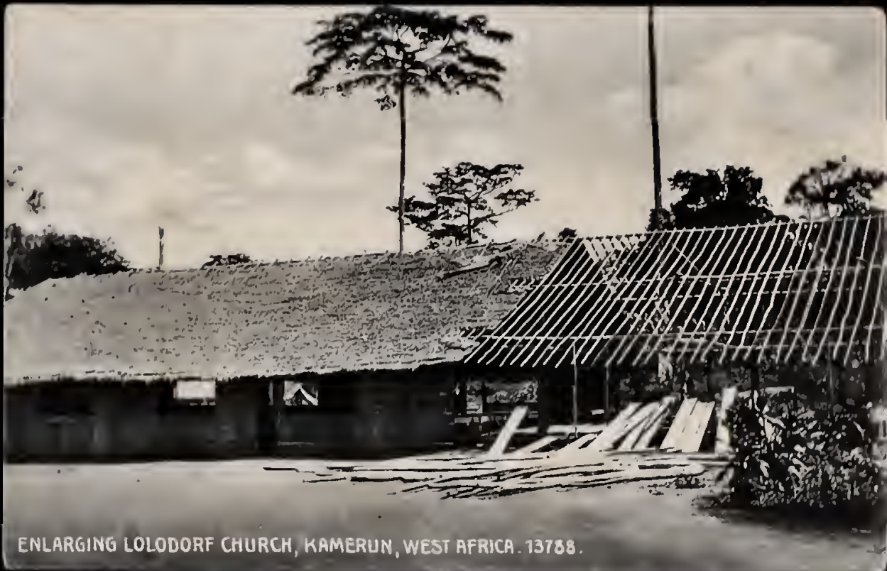
ENLARGING LOLODORF CHURCH, KAMERUN, WEST AFRICA. 13788.