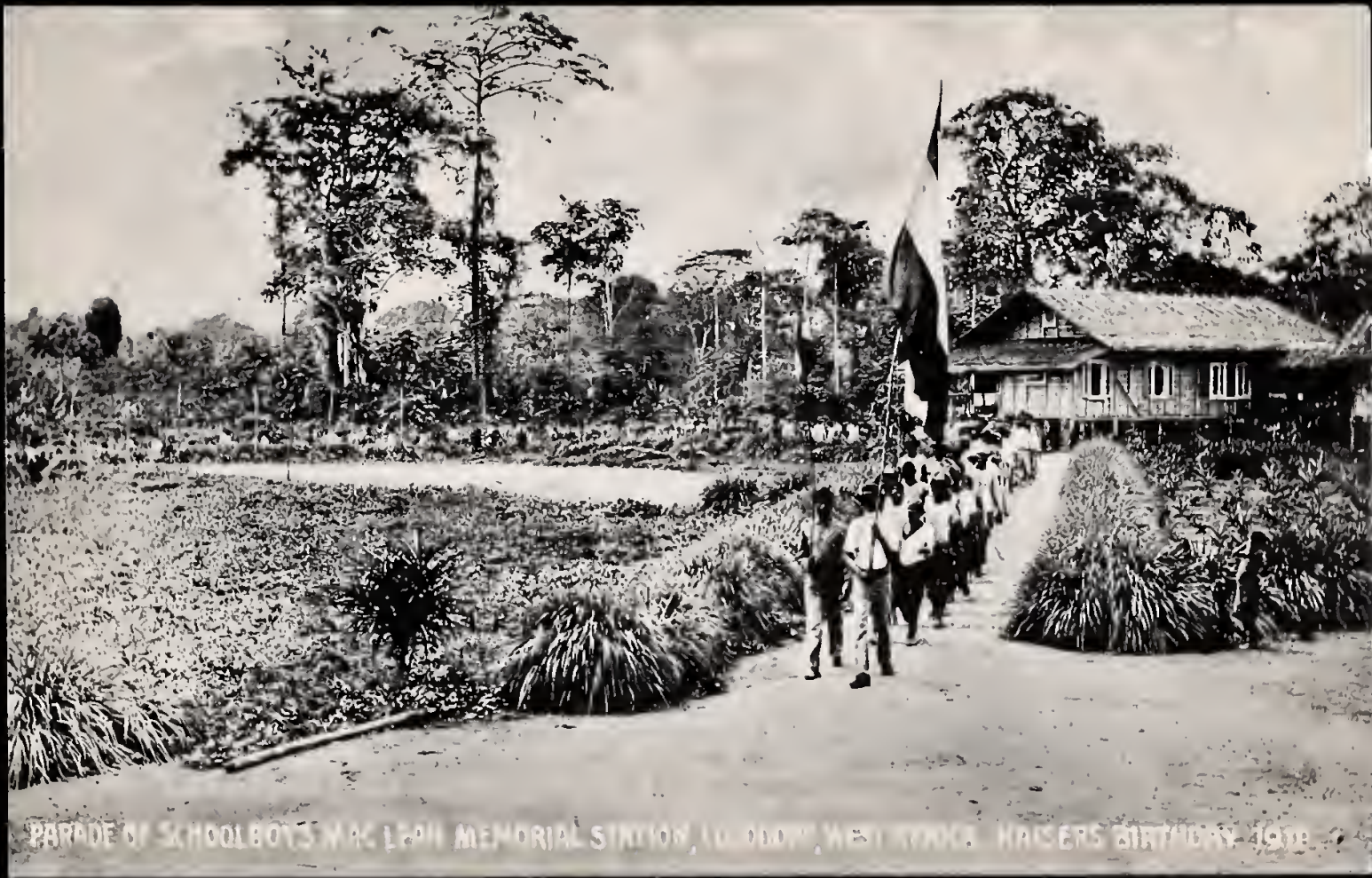
PARADE BY SCHOOLBOYS MAC LEAN MEMORIAL STATION, U. S. DEPT. WEST TROOP. HAISERS BIRTHDAY 1909