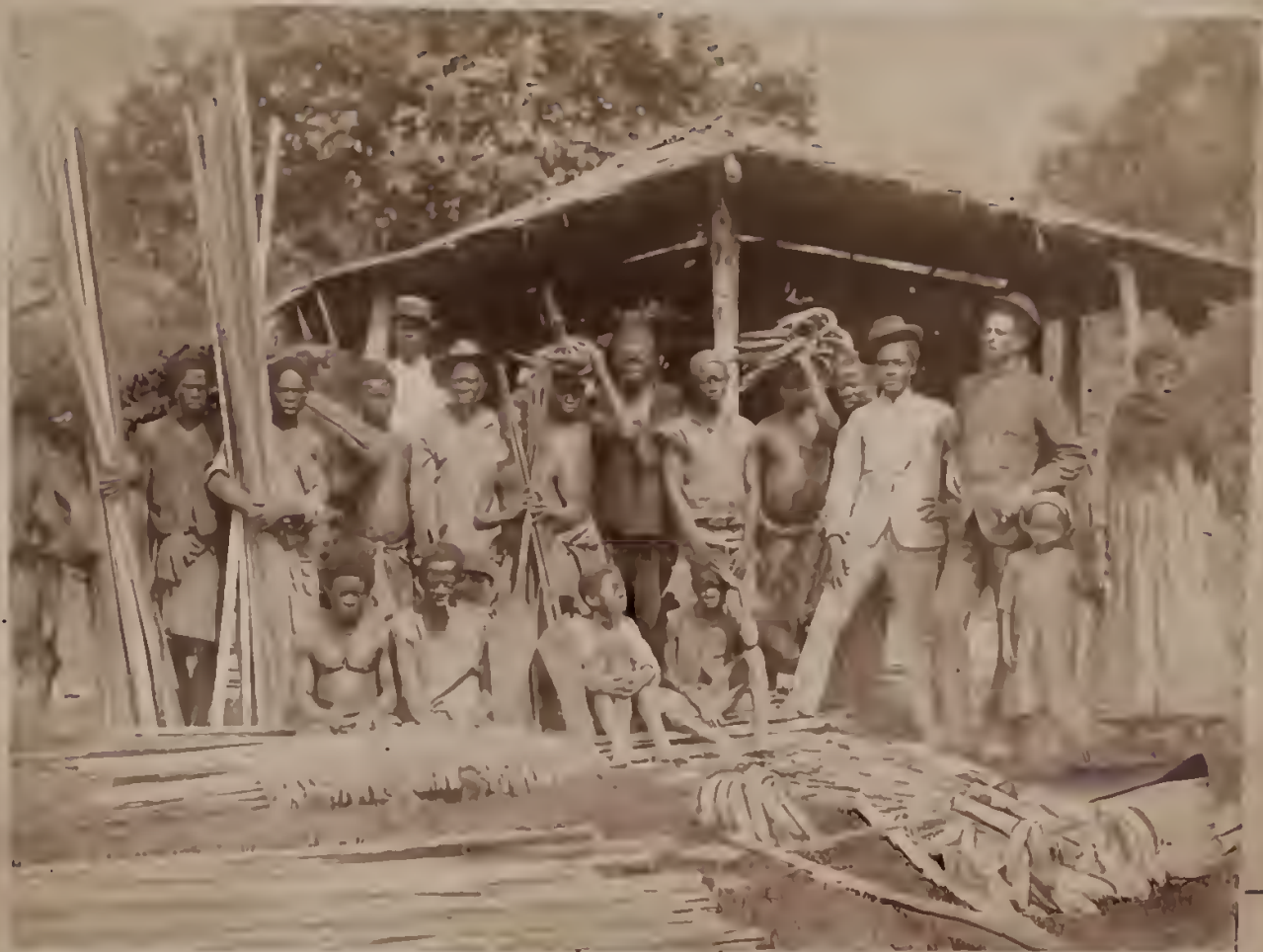
Native Traders. Mpongwe tribe. Gaboon. West Africa