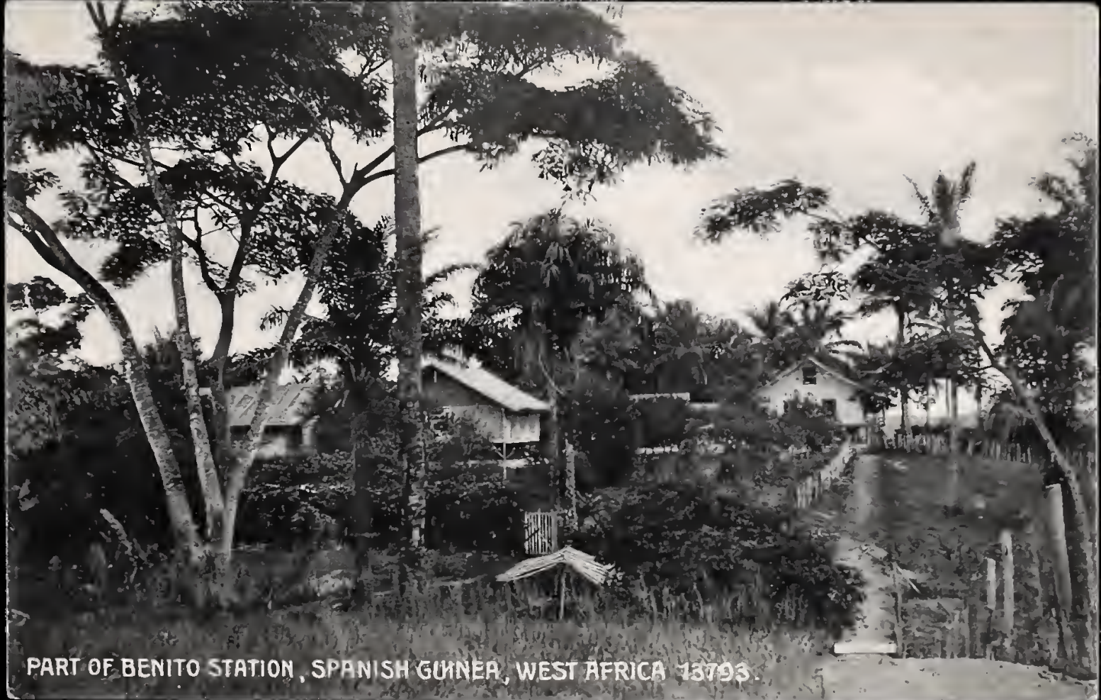
PART OF BENITO STATION, SPANISH GUINEA, WEST AFRICA 1879.