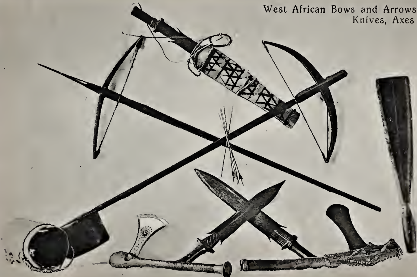
West African Bows and Arrows, Knives, Axes etc.