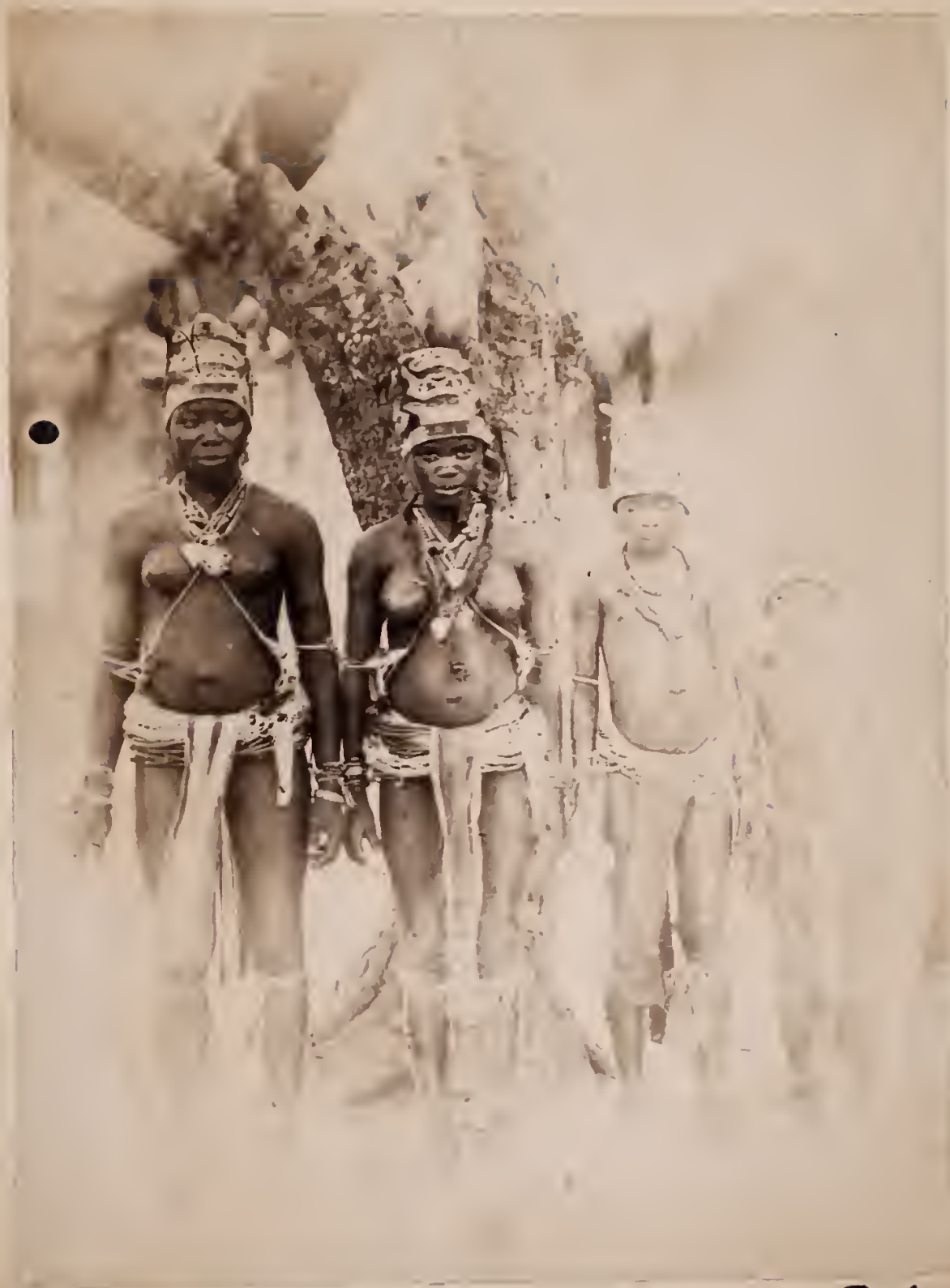
Bulu tribe (Fang). Batanga West Africa.