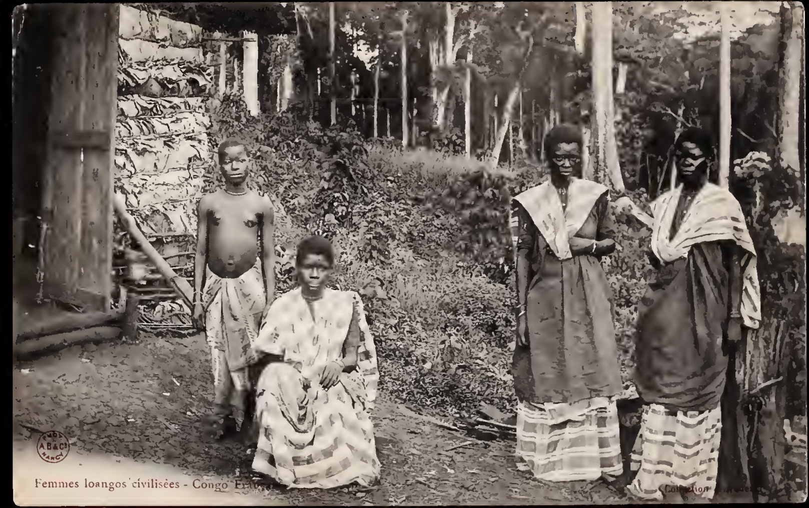
Femmes loangos 'civilisées' - Congo Étranger