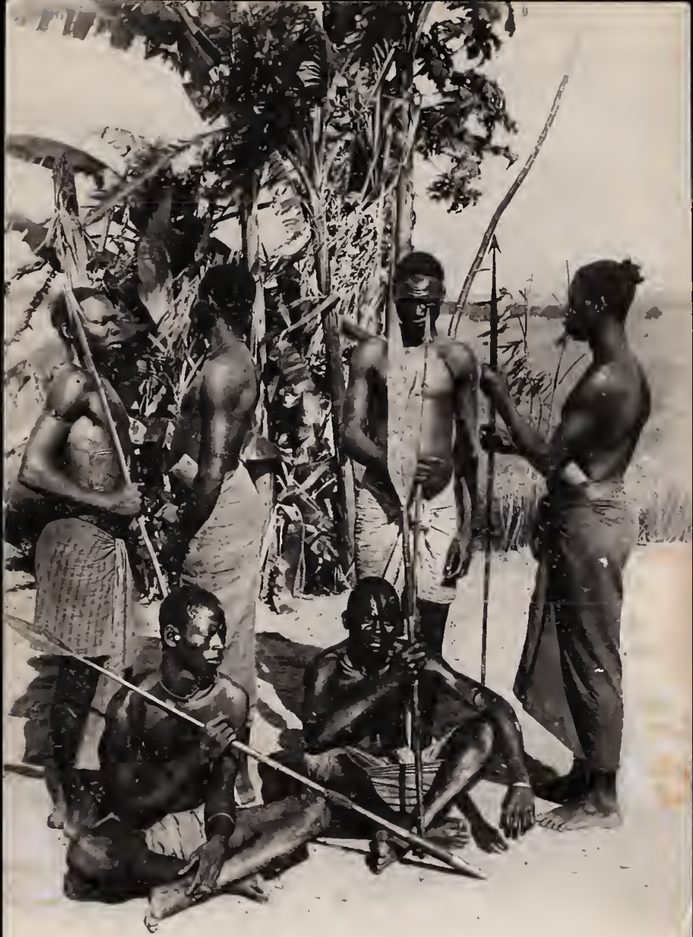
Indigènes du Congo Français