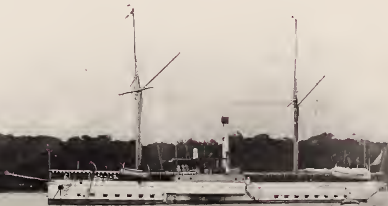
L' " Alcyon " Aviso stationnaire au Congo Français